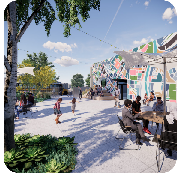
Clay Holden Architects

While shelter is a fundamental charge of the architect, the AIA | LA has been looking to establish a permanent home of its own for some time. We were able to pursue our dream of building a freestanding space in the heart of Los Angeles through careful fiscal management over many years. Today, we are very close to completing this project, and now need the support of our members and friends to get us over the finish line. Please help us make our dream a reality by reviewing the donor and sponsorship opportunities and making a contribution.