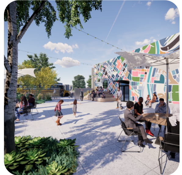
Clay Holden Architects

While shelter is a fundamental charge of the architect, the AIA | LA has been looking to establish a permanent home of its own for some time. We were able to pursue our dream of building a freestanding space in the heart of Los Angeles through careful fiscal management over many years. Today, we are very close to completing this project, and now need the support of our members and friends to get us over the finish line. Please help us make our dream a reality by reviewing the donor and sponsorship opportunities and making a contribution.